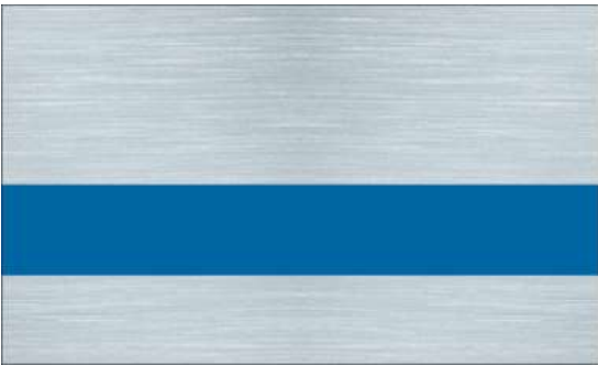
Brushed Silver/Atlantis Blue